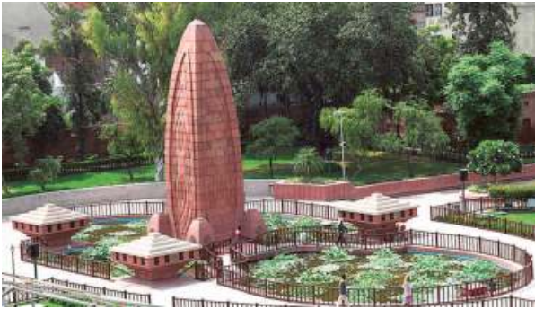
Symbol of valour: A view of the renovated Jallianwala Bagh Martyrs' Memorial in Amritsar.