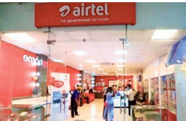
Girding for battle: Fresh capital provides a good buffer if India becomes a two-player market, says Credit Suisse. *REUTERS

Mittal sees scope to accelerate investments in roll-out of 5G services, fibre and data centre business