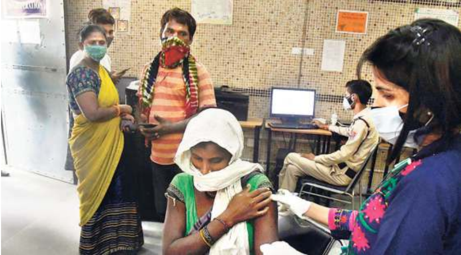
A health worker administers a vaccine shot to a beneficiary in west Delhi on Monday.

A total of 10,828 vaccinations were administered in the city on Sunday and a total of 1,32,28,841 doses have