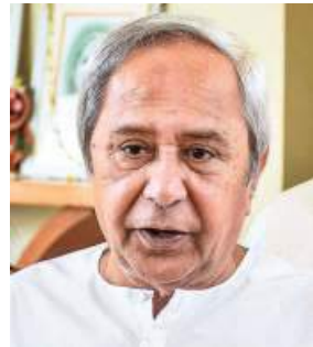
CM Naveen Patnaik

deceased Kulamani Baral, had filed case in Mahanga Police Station against 13 persons including the Minister, alleging their involvement in the murder.