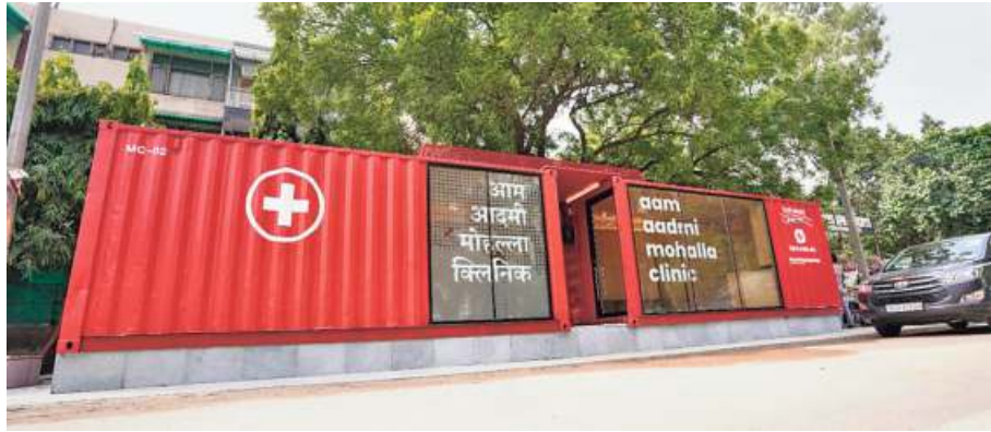
Care on the move: The mohalla clinic at Shakur Basti has been created using shipping containers and can be shifted in trucks from one place to another.

“The report shows that highly toxic, untreated leachate is being discharged in the forest. Based on this re-