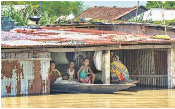
A family takes shelter on boats at a flood-hit area in Morigaon district on Monday.

Crop on 30,333.36 hectares of land and 2,56,144 domesticated animals have also been affected, ASDMA