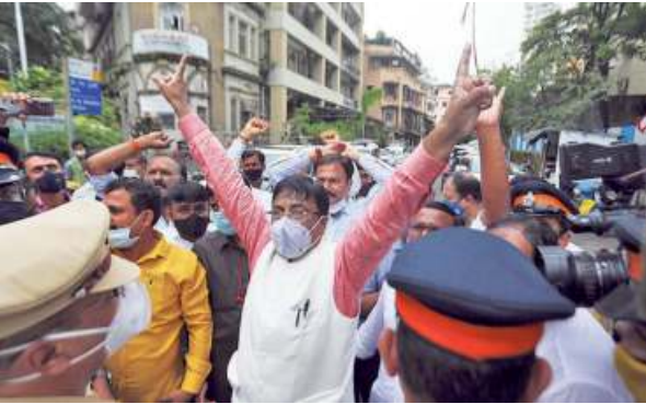
BJP leader Sudhir Mungantiwar during a protest outside Babulnath temple in Mumbai on Monday.