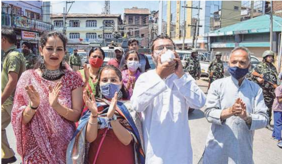
Festival cheer: Kashmiri Pandits taking out a procession on Janmashtami at Lal Chowk in Srinagar on Monday.

baric and illegal instructions as only a wrong choice of words. It once again clearly reiterates what we have been saying, which is that the Manohar Lal-Chautala government is at war with its own people," said the press statement.