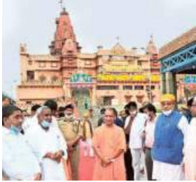
U.P. CM Yogi Adityanath arriving at the Sri Krishna Janambhoomi temple in Mathura on Monday.

He suggested that those engaged in liquor and meat trade may take up selling milk in order to revive the glory of Mathura, that was known for producing huge quantity of animal milk. Mr. Adityanath also prayed to Lord Krishna to eliminate the novel coronavirus infection.